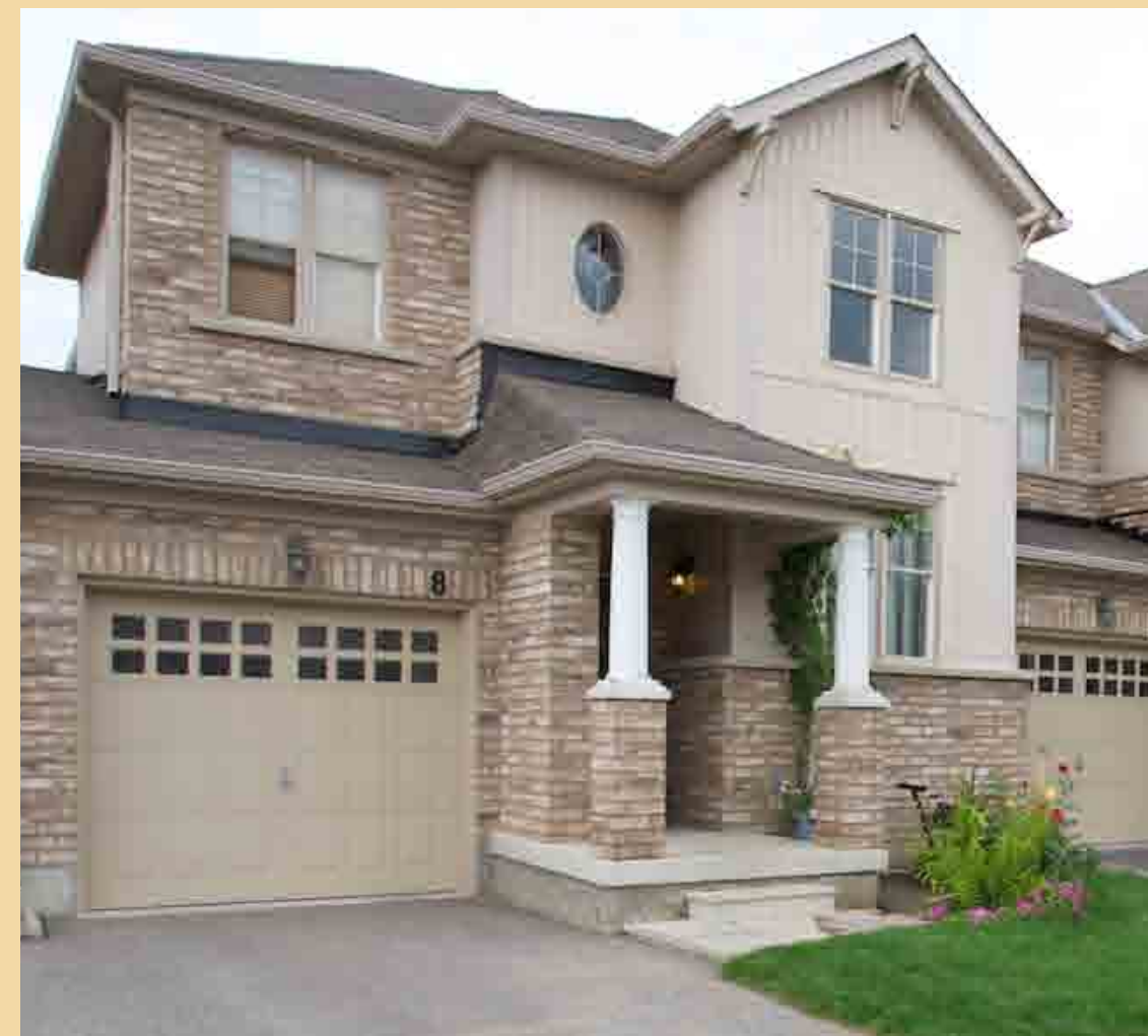
Oak Ridges Urban Elegance